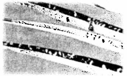
Underside of an infested palm frond.

ALWAYS FOLLOW LABEL DIRECTIONS. The Label is the Law.